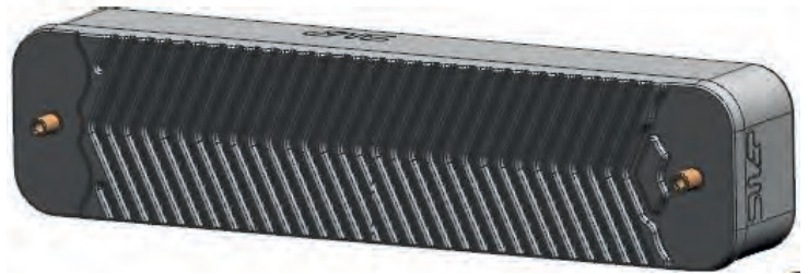
Fig. 1: Hydroblock